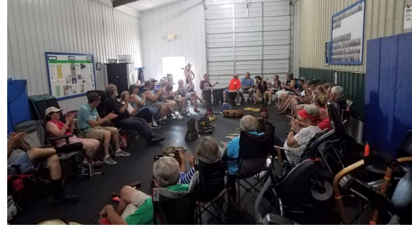
Here are some photos from our Picnic.